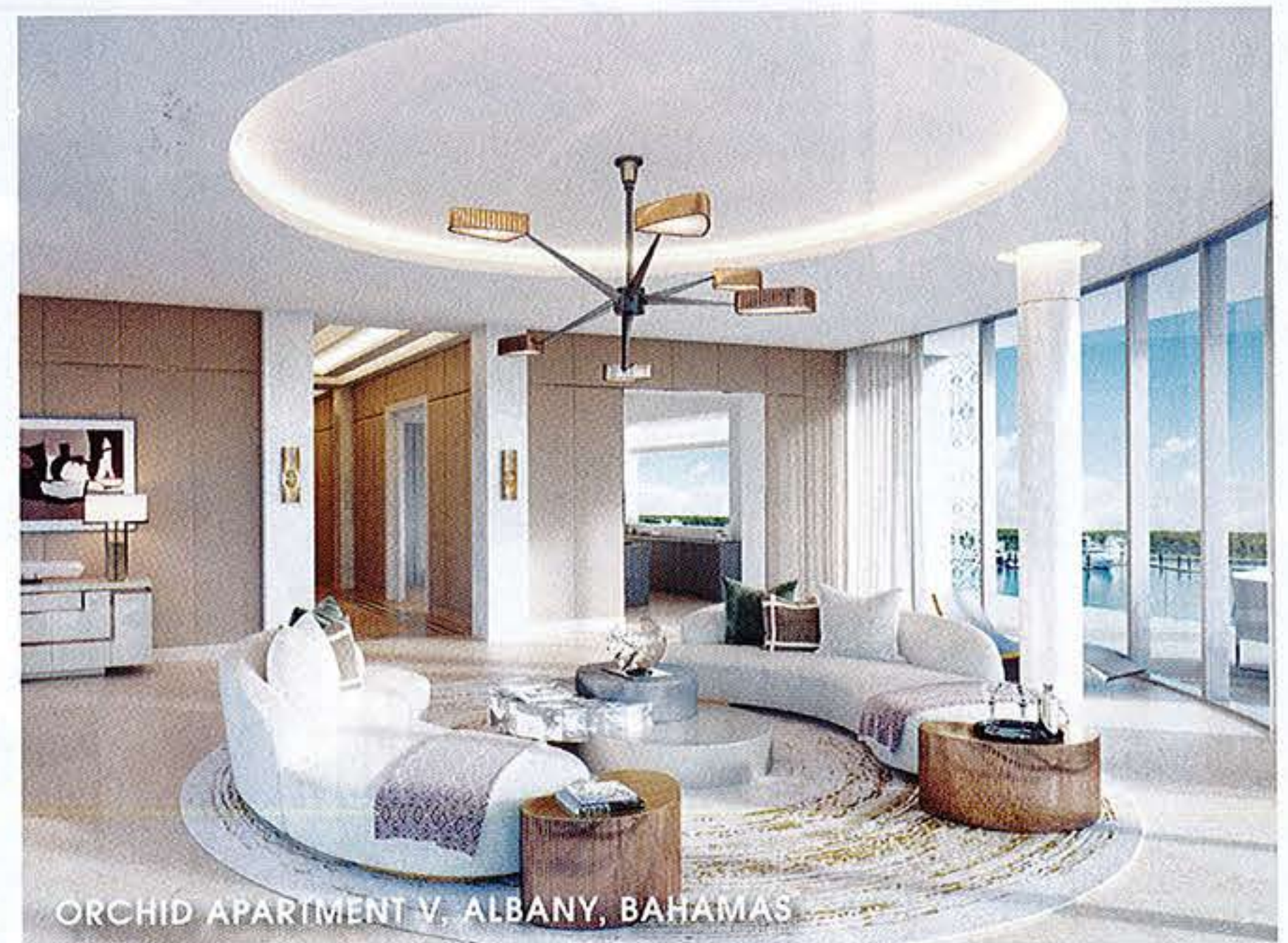
ORCHID APARTMENT V, ALBANY, BAHAMAS