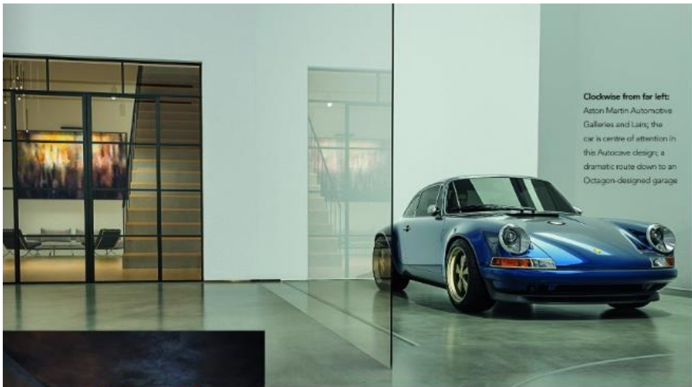
Clockwise from far left: Aston Martin Automotive Galleries and Lairs, the car is centre of attention in the Autocave design; a dramatic route down to an Octagon-designed garage