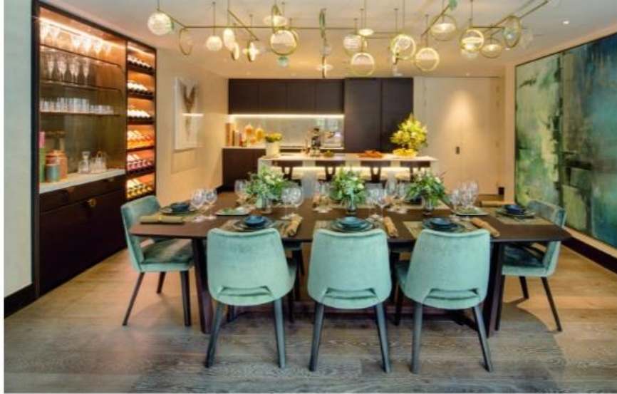
Top to bottom: the show apartment at Clivedale London's The Mansion in Marylebone includes a wine wall, showing would-be residents what they can have in their home; bottles are electronically logged in London Projects' wine pod