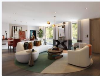
Garden Villas at Regent's Crescent start from £5,350,000. regentscrescent.com

Dominic Jeffares All articles by Dominic Jeffares