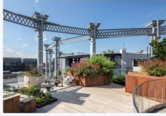
Apartments at Gasholders start from £745,000. gasholderslondon.co.uk