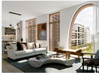
Prices for a two-bed apartment start from £1.15m. cadencekingcross.co.uk