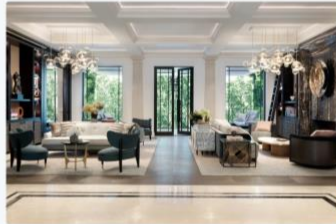
Prices for a four-bed property at Twenty Grosvenor Square start from £12gm. 20gs.com