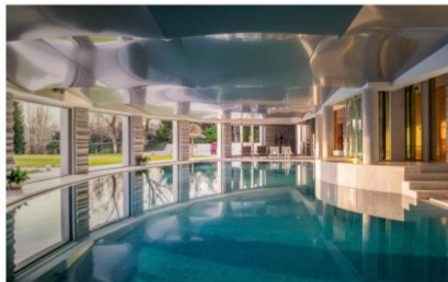
A Hampstead property with 25-metre indoor pool, gym, steam room and sauna with picture glass wall looking at a private section of garden

And the cost? That may give you the shivers too. Nick Stuttard of London Projects, estimates that to build a cryo-chamber in a 6,000 sq ft house (ie. a mega-mansion), you would be looking at about £250,000.