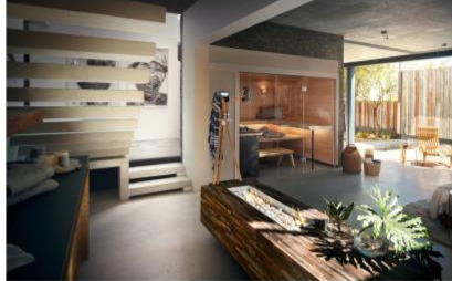
Saunas are going infra-red. Sauna by KLAFFS at Guncast

That means not only can you swim in a cantilevered Norwegian stone infinity pool overlooking the Bay or be pampered in the property's separate wellness cottage, you can also feel reassured that the very fabric and functioning of the building are good for your health too.