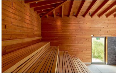
Sauna by KLAFS at Guncast