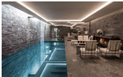
A sociable yoga space, and an opulent pool, by London Projects